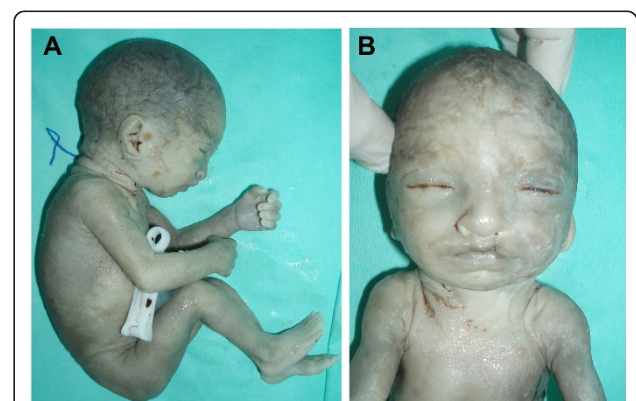
Figure 1 Autopsy of a 24 weeks' gestation female fetus after pregnancy termination (Case 2) that showed external features of facial dysmorphism with bilateral cleft lip, hypertelorism, broad and high nasal bridge, small filter and large ears.

Amniotic fluid was collected from case 1 and case 2 at 23 weeks of gestation. Cytogenetic analysis was performed on cultured amniocytes by G-banding according to standard procedures. At least 20 metaphases were analyzed per case, revealing a male karyotype with terminal deletion of the short arm of one of chromosome 4 [46, XY, del(4)(p15.33)] in case 1, and a female karyotype with terminal deletion of the short arm of one of chromosome 4 [46, XY, del(4)(p15.31)] in case 2. a-CGH was done on DNA from cultured amniocytes to characterize the extent of the deletions using a 100 kb resolution array (kit 44 K) in case 1 and a 40 kb resolution (kit 180 K) in case 2. Molecular karyotyping was carried out through oligonucleotide array-CGH platforms (Agilent Technologies, Santa Clara, CA) as described elsewhere [9].