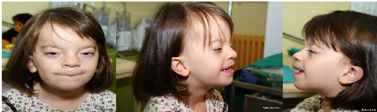
Figure 1 The facial features observed in our patient include ptosis, hypertelorism, low-set dysplastic ears and a prominent forehead.

As conventional karyotyping of the proband did not reveal any structural rearrangements, the karyotype was therefore determined to be 46, XX. Molecular karyotyping was performed on the Agilent 60K platform. Data analyses indicated a 743 kb deletion of 11q22.3 (Figure 2). An aCGH analysis of the patients' parents did not show any abnormalities; thus deletion has been determined to be de novo . Confirmation of the deletion was